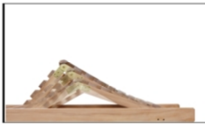
This lounger has 3 bent-knee positions.