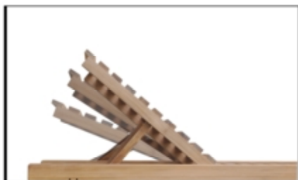
Back adjusts to 4 different positions.