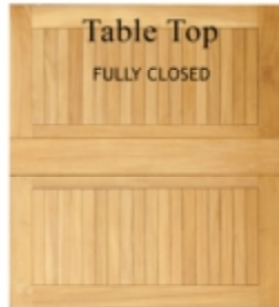
Table Top FULLY CLOSED