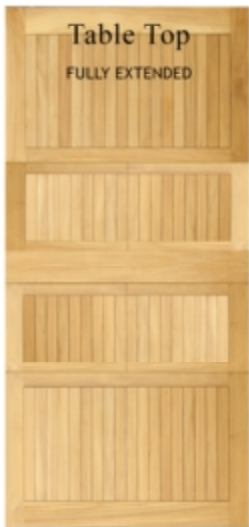
Table Top FULLY EXTENDED